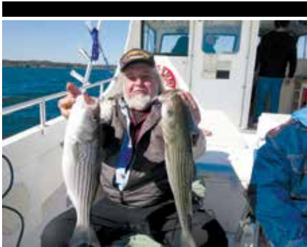
Fishing Trip to Point Lookout