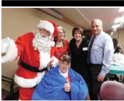
Santa and Mrs. Claus at the Winter Ball