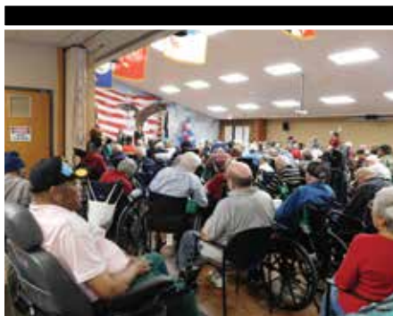
A full house for Veterans Day Ceremony