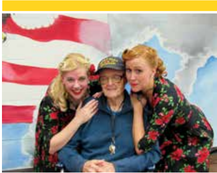
Song and dance team "Letters From Home"