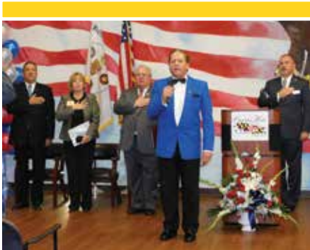
Veteran's Day ceremony at CHVH