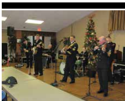
U.S. Navy Band Country Current Bluegrass