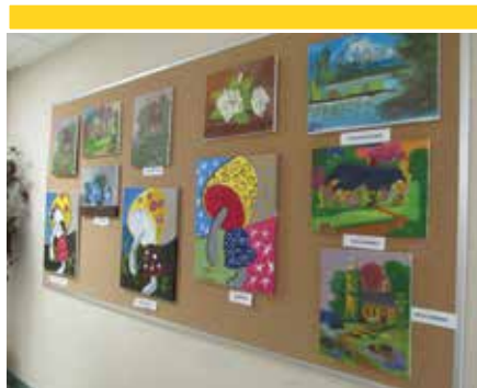
A collection of gifted residents' artwork