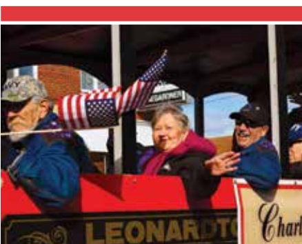
The crowds were cheering as our residents went by