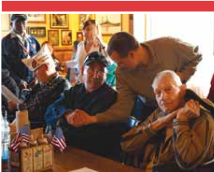
Mission BBQ treated our veterans to a hero's welcome