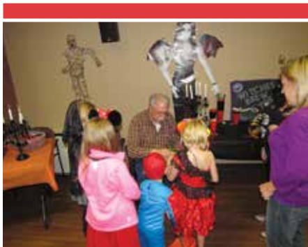
Happy residents loved seeing all the trick-or-treaters