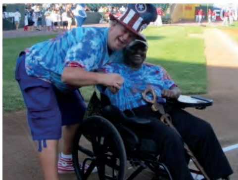
Blue Crabs Outing