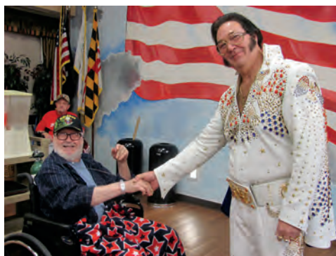
Happy Birthday Elvis Celebration