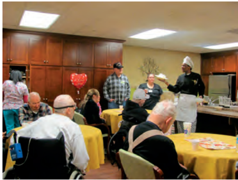
Stir Fry Cooking Session