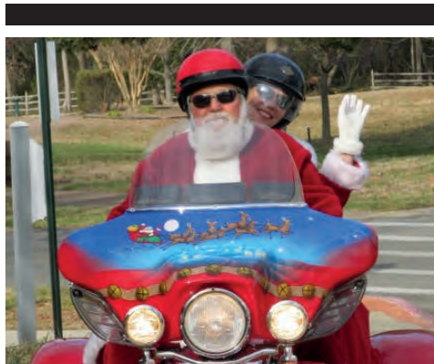
All American Harley Christmas