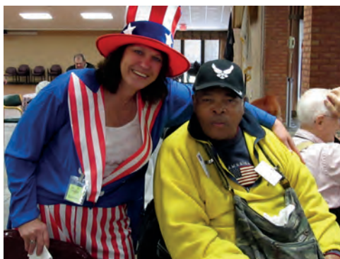
Memorial Day Ceremony