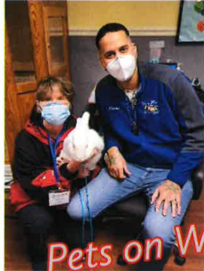
Pets on Wheels