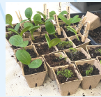
National Gardening Day April 14th