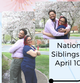
National Siblings Day April 10th