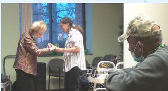
International Dance Day April 29th