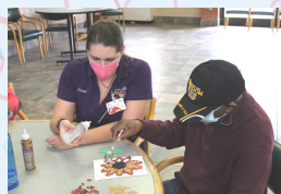
Earth Day April 22nd